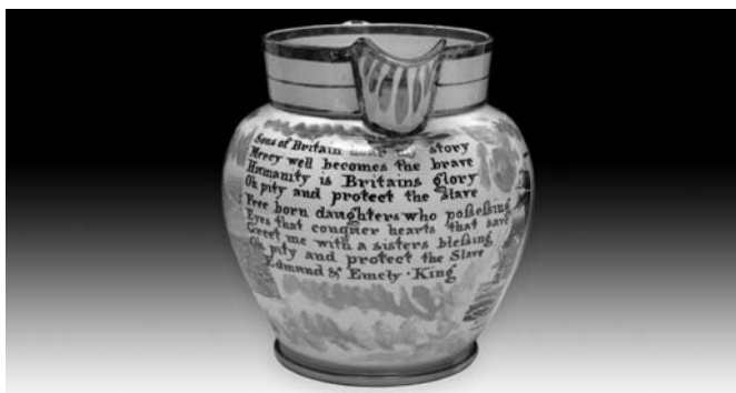
This is an earthenware jug made by Garrison Pottery in Sunderland around 1820 which includes an anti-slavery verse. It is in the collection of Sunderland Museum & Winter Gardens.