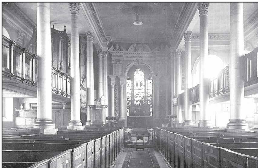
A view of the inside c.1900, showing the two side galleries and box pews