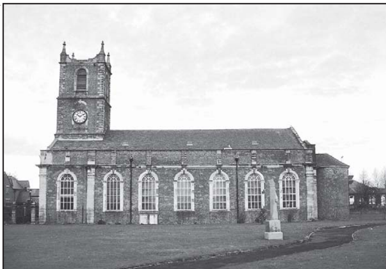
Holy Trinity Church today

www.sunderland.gov.uk/listed-buildings-search