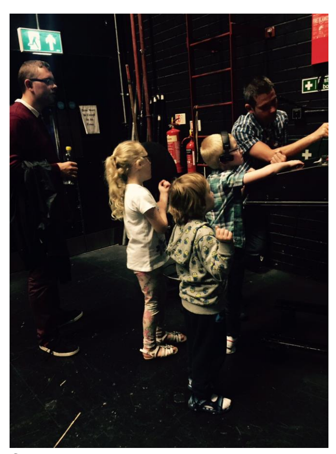
Children explore the Empire theatre as part of the Get Curious learning project

Sunderland Empire Theatre has a Creative Learning Team which works in partnership with North East Autism Society and other groups. The theatre is happy for people with additional needs such as a learning disability or an autistic spectrum condition to visit the theatre with friends, family or carers for an orientation visit prior to attending a performance, usually during the day when building is quiet. On occasions, the theatre