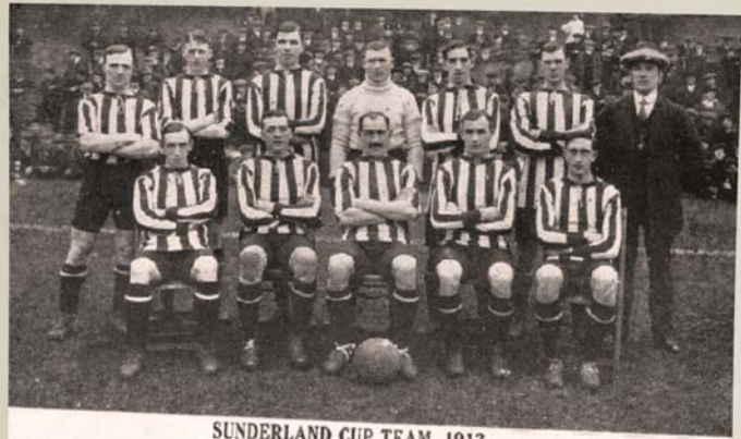
SUNDERLAND CUP TEAM. 1913.

Richmond 16, imprisoned at Richmond Castle until removed to France and sentenced to death for refusing to partake in war work. This was later commuted to 10 years imprisonment.