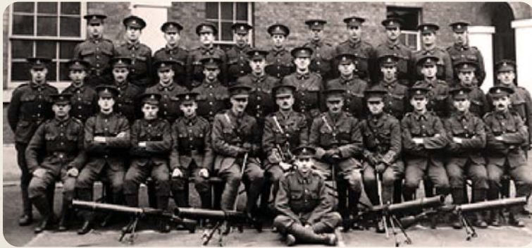
Durham Light Infantry 20th Division

Sunderland affiliated units deployed in the Battle of the Somme included Durham Light Infantry (7th and 20th), 160th Brigade Royal Field Artillery and Northumberland Hussars to name but a few. These units were recruited in Sunderland and the Territorial Force units were based at the Drill Hall, which was situated near Green Terrace and the Empire Theatre in Sunderland city centre.