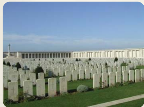
Pozieres British Cemetery

There are over 250 military cemeteries and memorials on the Somme battlefields for the many thousands of casualties who fell during this offensive.