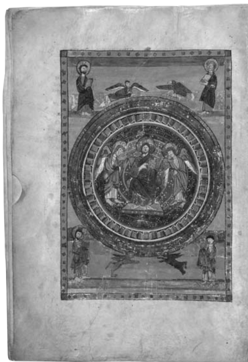
Illustration of Christ in Majesty

Abbot Ceolfrith, who succeeded Benedict Biscop as Abbot of the twin monastery of Wearmouth-Jarrow. The Bibles were made in the monastic scriptorium during his abbacy, 690-716 AD. It was a remarkable thing to undertake at the time; usually copies of books of the Bible were produced as single volumes (eg. the Book of Psalms) or volumes containing a small number of books (eg. the four Gospels). Ceolfrith intended to carry the Codex Amiatinus to Rome in AD 716 as a gift to Pope Gregory II. He left Wearmouth with an entourage of 80 followers, intending to spend his last days in Rome, but died in Langres monastery in France en route. Some of his followers took the Codex Amiatinus on to Rome and presented it to the Pope to fulfil Ceolfrith's wishes. The later history of the book is unknown until it reappeared at the monastery of San Salvatore at Monte Amiata in Italy, where it was highly prized and thought to be a 6th century Italian work. When the monastery was closed in the 18th century it was