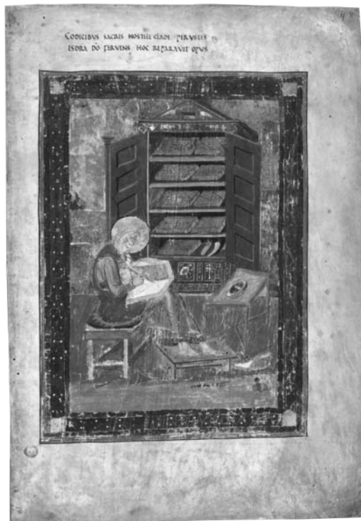
Illustration of Ezra, the Old Testament scribe