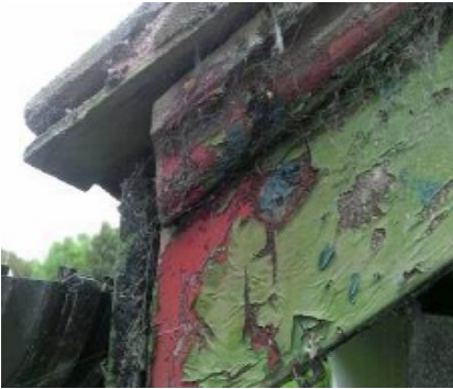
Item 7 Ref: EC002372

The cement verging to the external cement roof tiles does not contain asbestos.