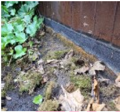
Item 24 Ref: RT000239

The cement verging to the external cement roof tiles does not contain asbestos.