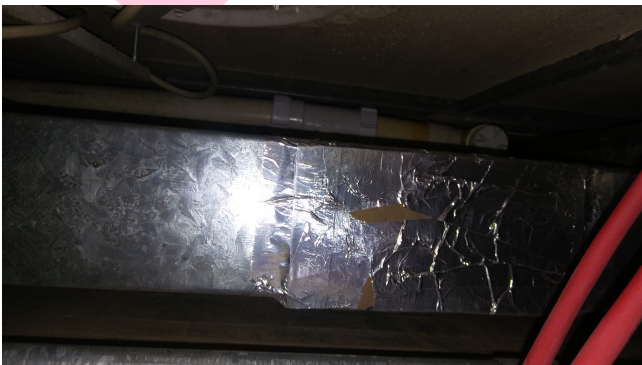
Item 9 Ref: As 359885-2

The Floor covering (Room 007/store) does not contain asbestos.