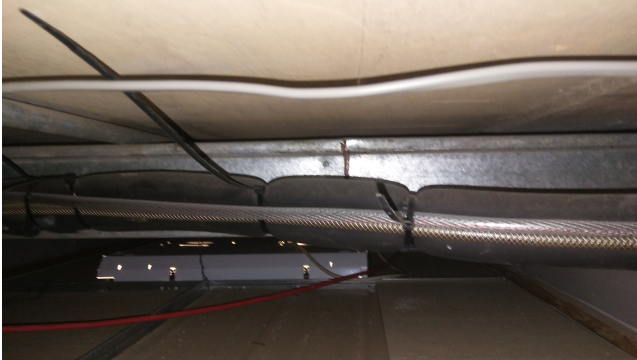
Item 7 Ref: 359885-7

The Red mastic to ductwork (Room 006/corridor and changing room – void above) does not contain asbestos.