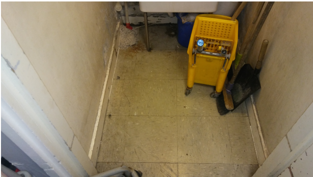
Item 8 Ref: 359885-5

The Red mastic to ductwork (Room 006/corridor and changing room – void above) does not contain asbestos.