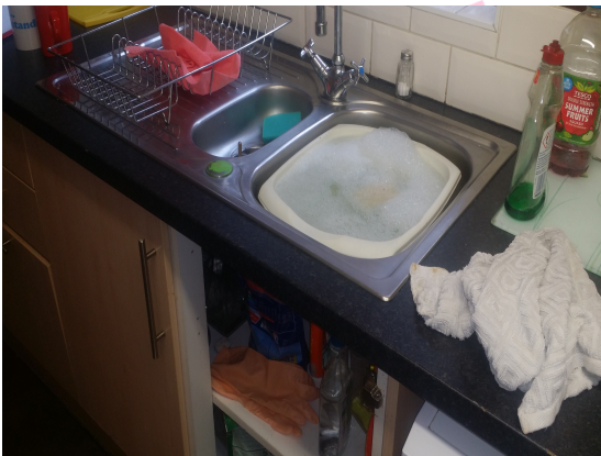
Item 15 - Ref: 315571-2

The sink pad in the kitchen does not contain asbestos.