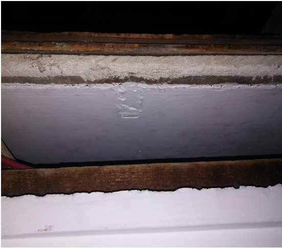
Item 14 - Ref: 275133-2

The panel to the left hatch does not contain asbestos.