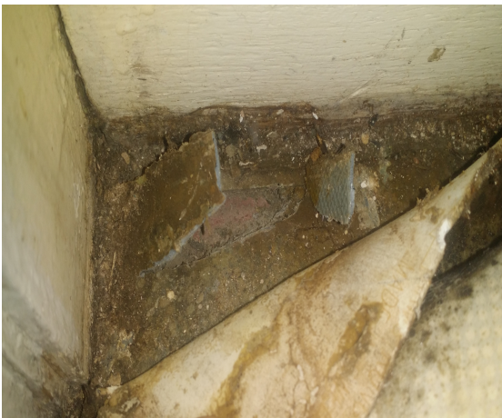
Item 16 - Ref: 315571-1

The linoleum in the kitchen does not contain asbestos.