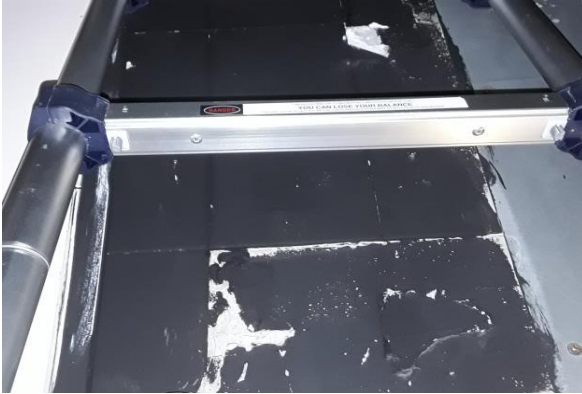
Item 34 Ref: 20-28162-3

The walls (tiles & adhesive) in the Cremator Room do not contain asbestos.