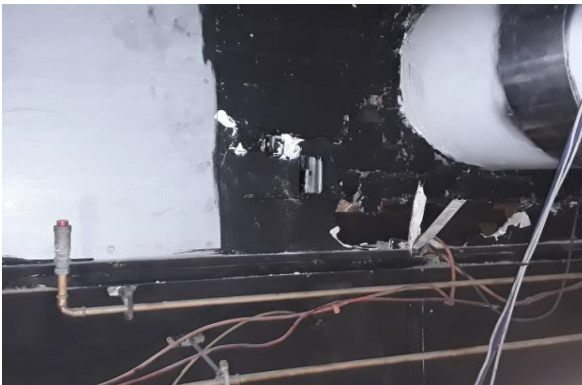
Item 35 Ref: 20-28162-4

The walls (tiles & adhesive) in the Cremator Room do not contain asbestos.