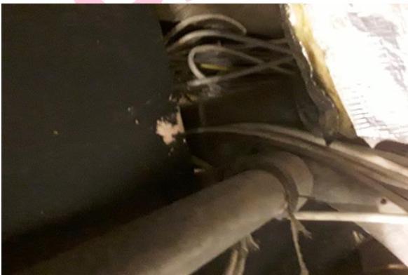
Item 36 Ref: 20-28162-5

The walls (plaster) in the Cremator Room do not contain asbestos.