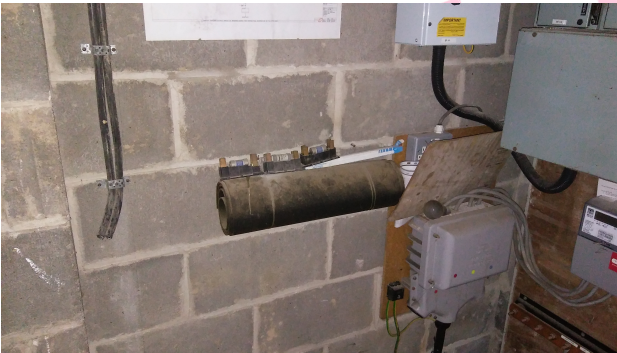
Item 13: 253789-6

The Gasket (036/Boiler Room) does not contain asbestos