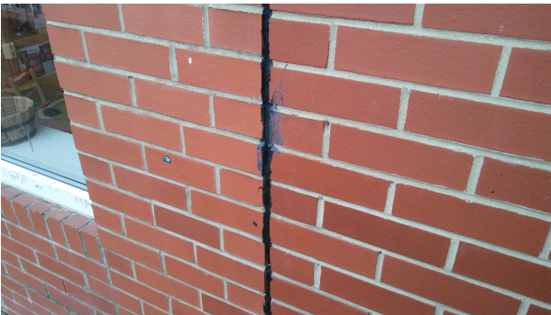
Item 14: 253789-7

The Millboard (038/Switch Room) does not contain asbestos