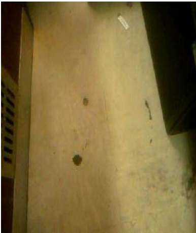
Item 2 – BB003031

The ceiling panels to the children and adult kitchen store do not contain asbestos