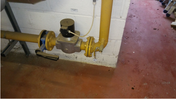
Item 12: 253789-5

The Gasket (036/Boiler Room) does not contain asbestos