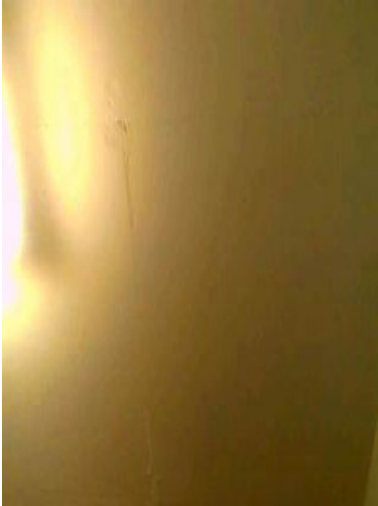
Item 1 – BB003030

The ceiling panels to the children and adult kitchen store do not contain asbestos