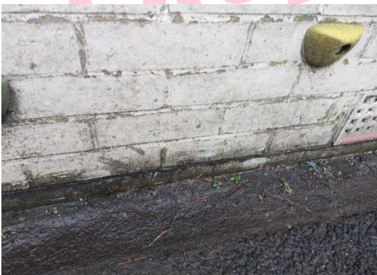
Item 45 Ref: 21-39567-33

The damp proof course to walls (Area 129/External) does not contain asbestos.