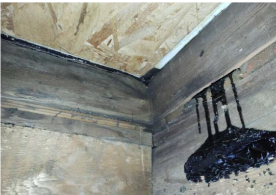
Item 21 Ref: 21-36876-2

The ceiling tiles above suspended ceiling in WC (Area 6) does not contain asbestos.