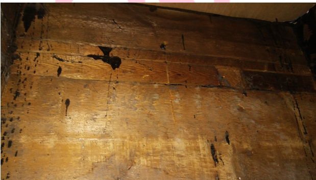
Item 9 Ref: As 348056-3

The packers to skylight surrounds (WC-void above Rm 0/06) do not contain asbestos.