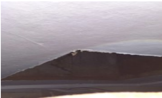
Item 32 Ref: As HD000490

The bitumen overspill to timber beams in the ceiling void (Toilets G/06) does not contain asbestos.