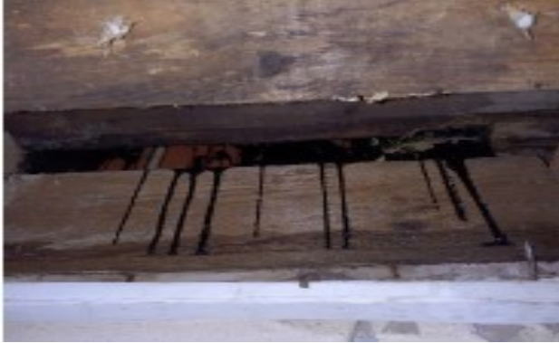
Item 31 Ref: HD000490

The bitumen overspill to timber beams in the ceiling void (Toilets G/06) does not contain asbestos.