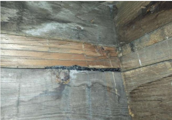
Item 19 Ref: 21-36876-2

The bitumen packers and residue around skylights in Girls Toilet (Area 5) does not contain asbestos.