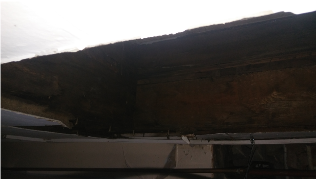
Item 8 Ref: As 348056-3

The packers to skylight surrounds (WC-void above Rm 0/05) do not contain asbestos.