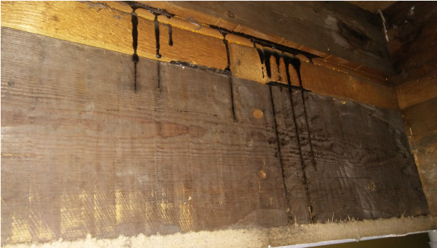
Item 7 Ref: 348056-3

The packers to skylight surrounds (WC-void above Rm 0/05) do not contain asbestos.