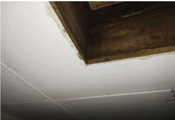
Item 20 Ref: 21-36876-1

The bitumen packers and residue around skylights in Girls Toilet (Area 5) does not contain asbestos.