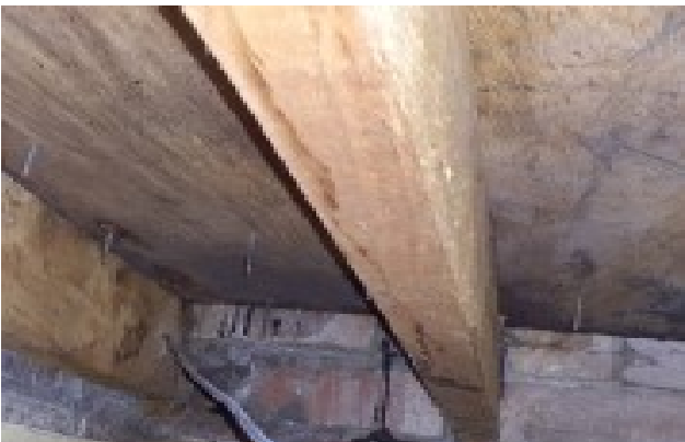
Item 33 Ref: As HD000490

The bitumen overspill to timber beams above fibroboard ceiling in the ceiling void (Toilets G/13) does not contain asbestos.