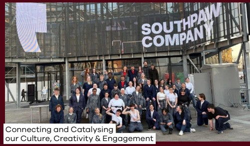
Connecting and Catalysing our Culture, Creativity & Engagement