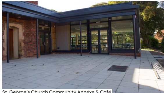
St. George's Church Community Annexe & Café

"The café has become a point of connection for people of all ages... serving 700+ customers per month There were times where we thought we'd have to pull the plug. But again, you know, the UKSPF funding really helped us move and deliver this project, and the community appreciate it."