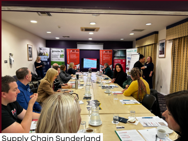
Supply Chain Sunderland