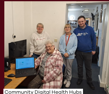
Community Digital Health Hubs