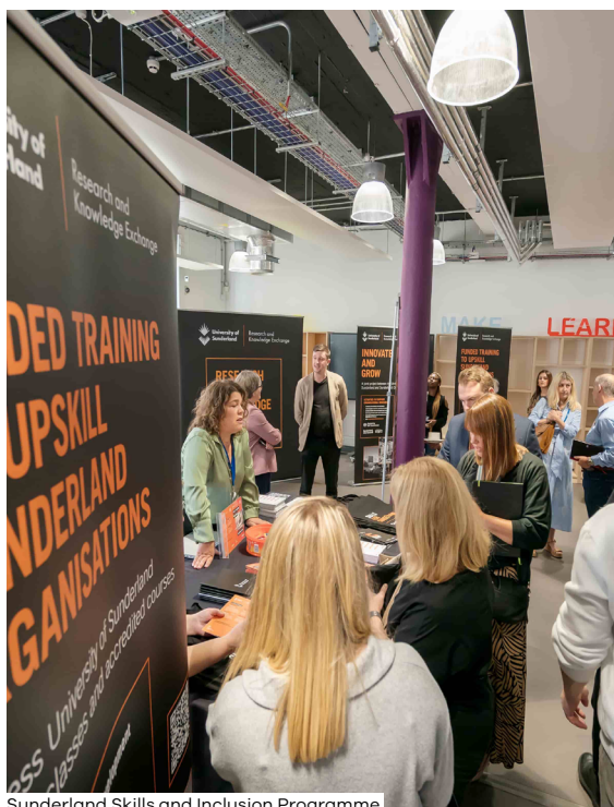
Sunderland Skills and Inclusion Programme

“We have a partnership of providers that we work with more closely. We have engaged with employers that would not have naturally worked with the university.”