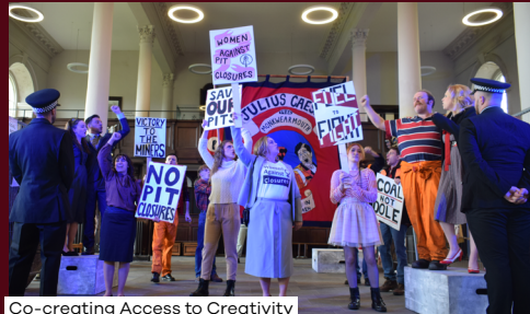
Co-creating Access to Creativity