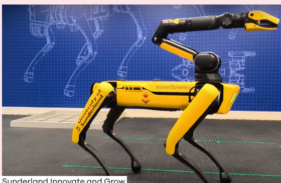
Sunderland Innovate and Grow

“The student examined opportunities and produced an overview on how we can improve our social media use... They developed a Social Media Strategy which is now in place... also produced a corporate video showing the work of staff and customers, which we now use for fundraising... The support has helped us improve the skills of our staff, brought us new users and enabled us to attract new investment or funding.”