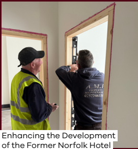
Enhancing the Development of the Former Norfolk Hotel