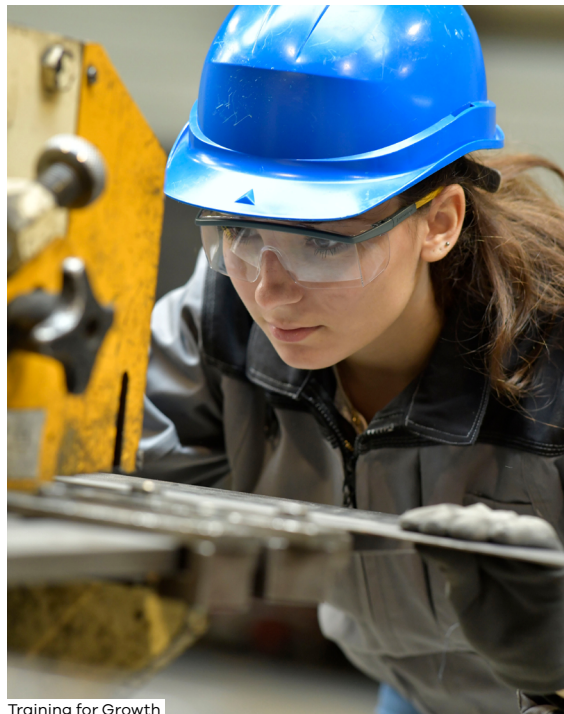
Training for Growth

“The high-quality support from Training for Growth has been great for the business. The project supported the wages of a new Apprentice for 6 months. We appointed a female Apprentice who fitted well into the organisation. We wouldn’t have employed the apprentice without it, and it has allowed us to improve our productivity.”