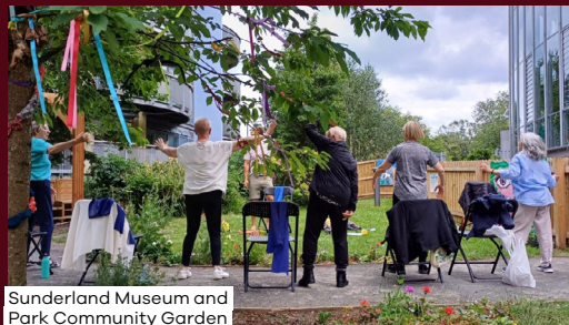
Sunderland Museum and Park Community Garden