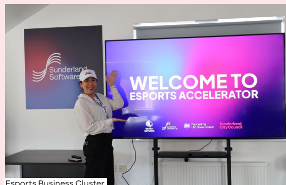
Esports Business Cluster

“We had the privilege of being among the 14 UK start-ups selected to participate in the first British Esports and Sunderland Software City Accelerator program. It was an incredible experience.”