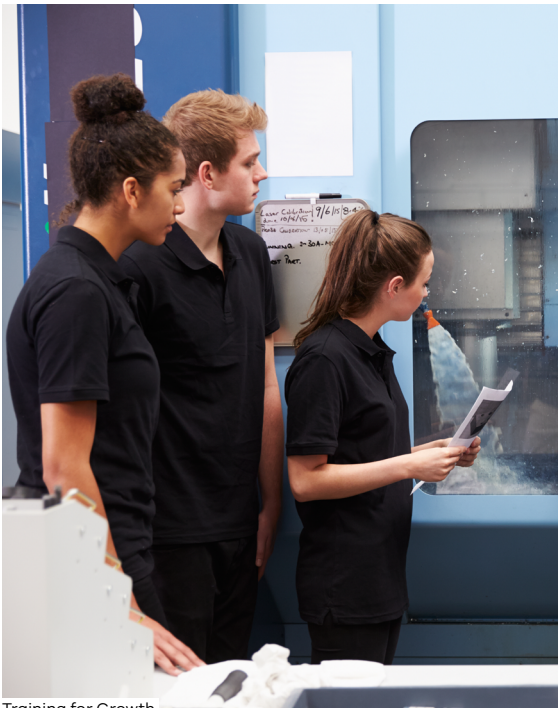
Training for Growth

They’ve come in typically younger than the average age of employees across the businesses, and they’ve added new life into the business as well... from an apprentice perspective as well, we’ve had some really good feedback that it’s great, they’ve gone into business, they’ve been able to learn and at the same time, and they see themselves really as having a great foothold within a business. And they’ve now got a fantastic career opportunity as they move forward.”