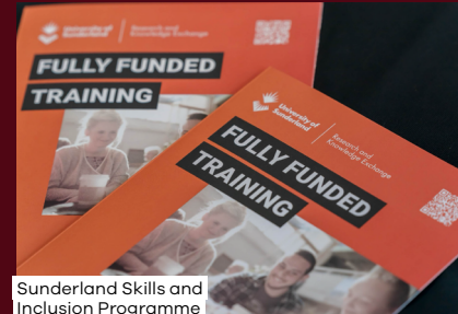
Sunderland Skills and Inclusion Programme