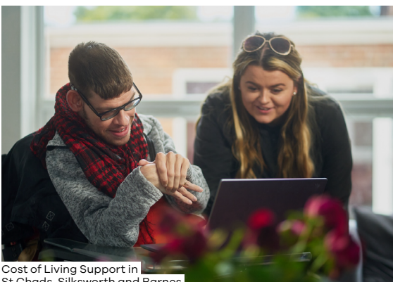
Cost of Living Support in St Chads, Silksworth and Barnes

"The project all round has made a massive difference to my life and my mental health and wellbeing, it's been amazing". "I got help to pay bills online so not paying a charge for paper anymore". "It's been very helpful. I got support with my electricity supply, lightbulbs, got meters changed, received a lot of other support and made new friends". "I was paying a fortune for broadband... they also helped sort my mobile so all in all saving me about £60 a month"