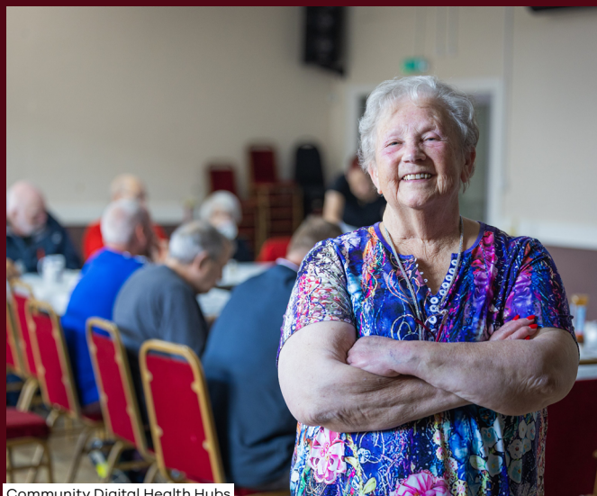
Community Digital Health Hubs