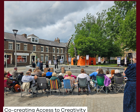
Co-creating Access to Creativity