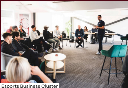
Esports Business Cluster