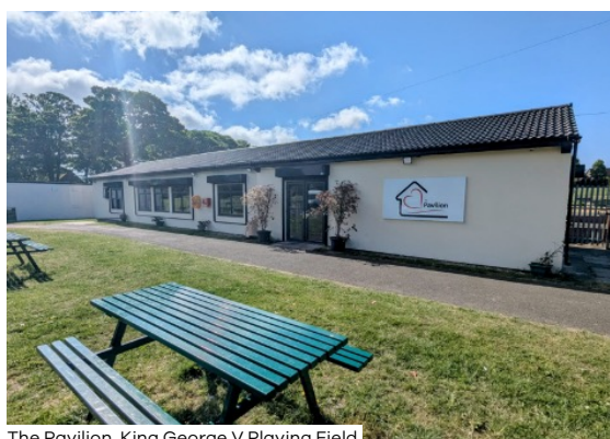
The Pavilion, King George V Playing Field

“It [the UKSPF project] has made a massive difference to the area... including reducing anti-social behaviour. This project had a major ripple effect... engaged the local community including local children... gone on to gain 5 years revenue funding, created 4 jobs and provided numerous services to the community... a previously unemployed resident has started up a café in the premises.”