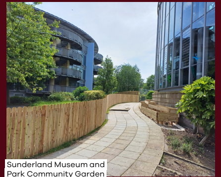
Sunderland Museum and Park Community Garden