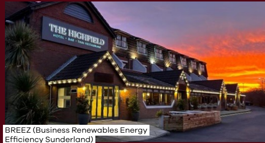
BREEZ (Business Renewables Energy Efficiency Sunderland)