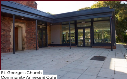
St. George's Church Community Annexe & Café