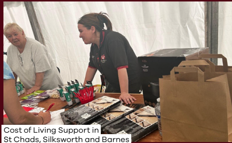
Cost of Living Support in St Chads, Silksworth and Barnes