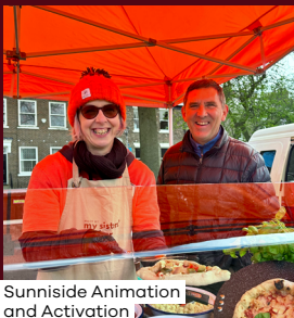
Sunnyside Animation and Activation