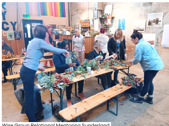
Wise Group Relational Mentoring Sunderland

“The training courses helped pave the way for me to have the confidence and vision to know where I can be in the future.”